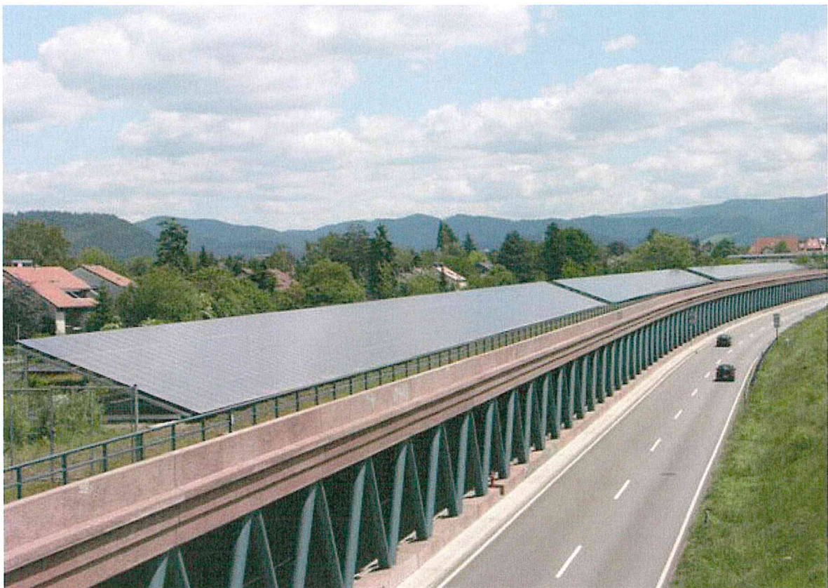
A community-owned PV array on a noise barrier in Freiburg, Germany.

power firm gouges you, call up the one you want to switch to, and they will gladly handle the paperwork with your current provider so you can switch at the end of the month.